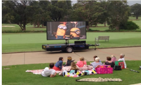
AT16 in Australia