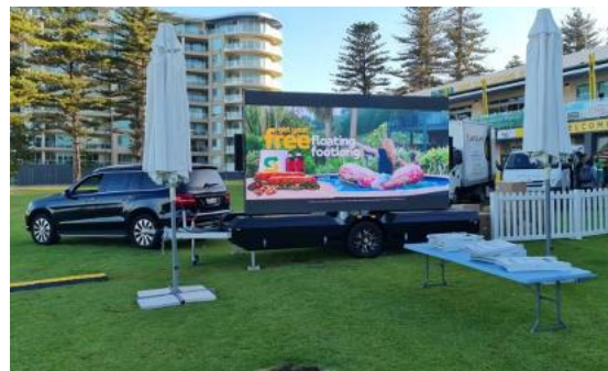
LED Advertising Trailer Shows in Adelaide