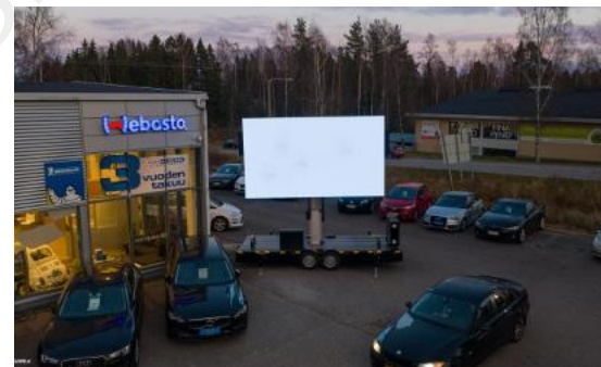
AT12 in Finland