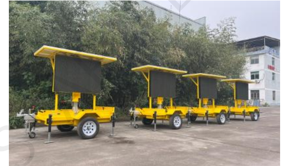
Solar LED traffic trailer exported to the Australia