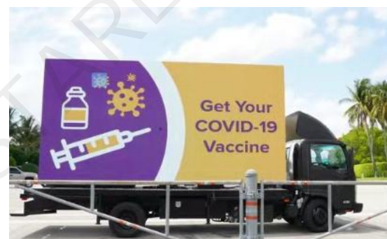
28m² LED advertising vehicle in the United States