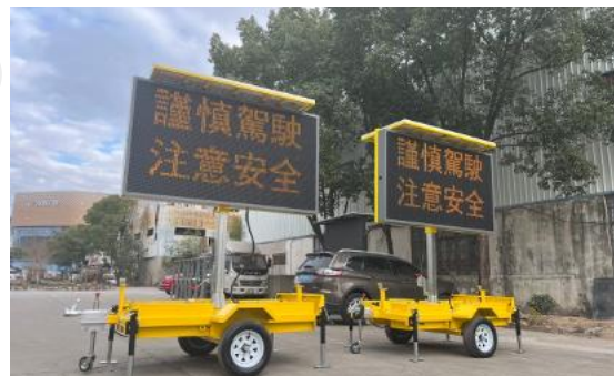
VMS solar led trailer In Hong Kong