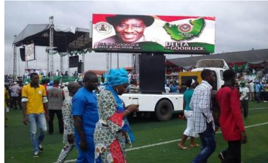
LED Display Trailer in Nigeria