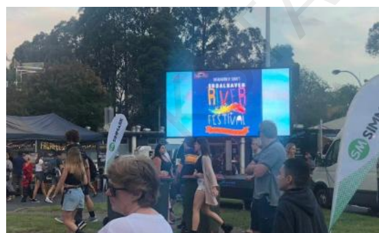
LED Advertising Trailer in New Zealand Plaza