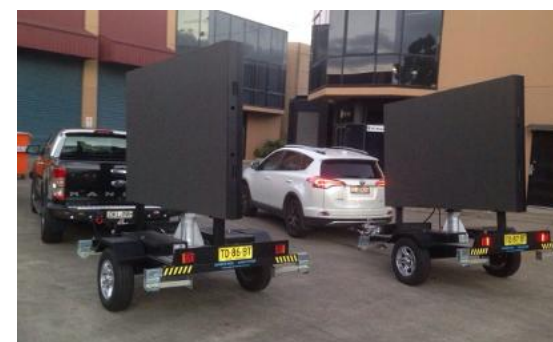
AT4 In Australia