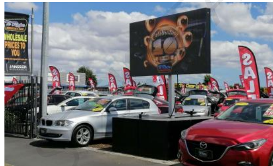
AT4 in New Zealand Plaza