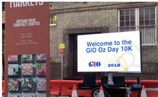
AT4 in Australia