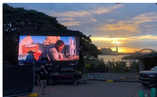
LED Advertising Trailer in Sydney Grand Theatre