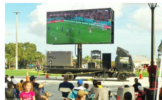
LED Display Trailer in the USA