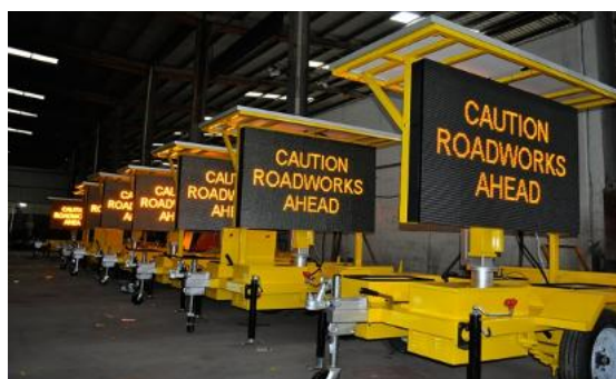
Solar LED traffic trailer exported to the UK