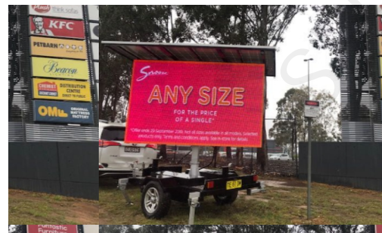
AT4 Solar in Sydney