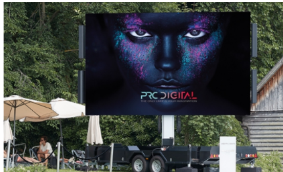
AT12 in Finland