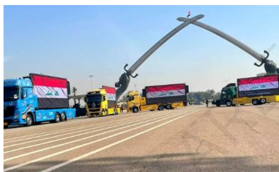
Military parade for the 100th anniversary of the Iraqi army's 'founding