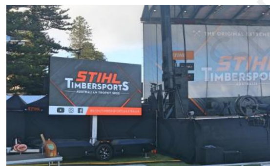
AT8 in Australia