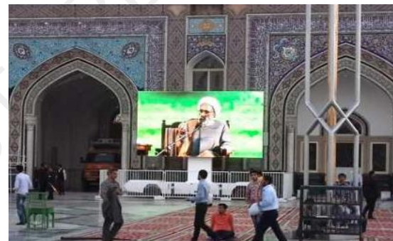
AT22 in Iran