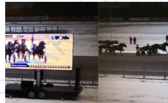
AT12 LED Trailer in Racecourse