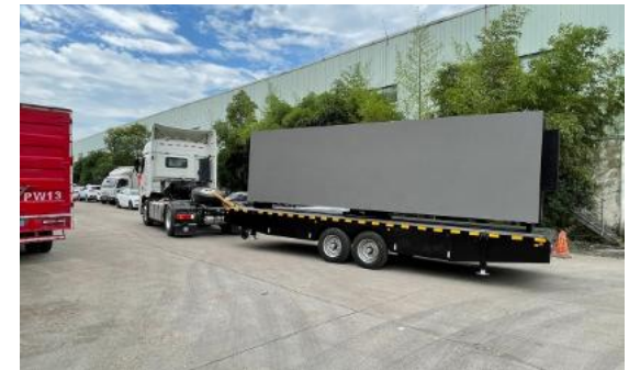
AT28 LED Screen Trailer in the USA