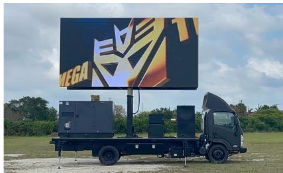
360 degree rotation LED advertising truck In America